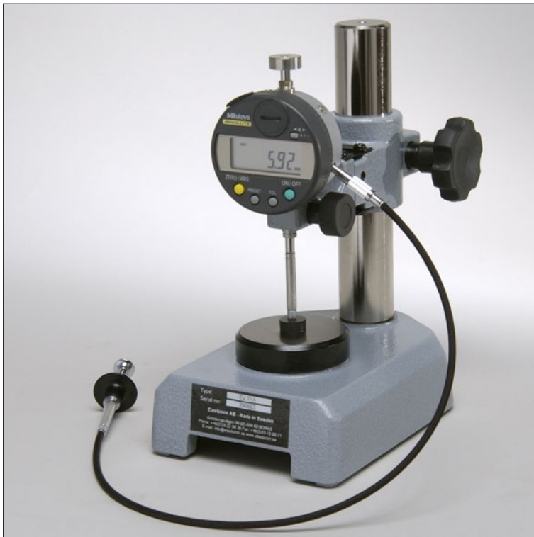
Thickness Gauge EV 01 for thickness measurement according to ISO 23529 and compression set measurement according to ISO 815.