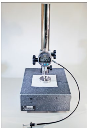
Thickness Gauge EV 06 for thickness measurement according to ISO 5084 for textiles.