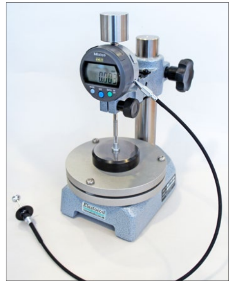
Thickness Gauge EV 01 F is a special version, with the possibility to set the parallelity between measuring foot and table.